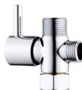
T-adapter with Shut-off Valve