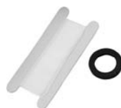
Plumber's Tape, Washer